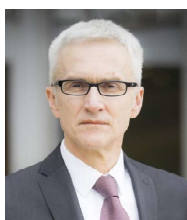
By: Jürgen Stock

A terrorist arrested attempting to cross a border while using a stolen passport. A child abuse victim rescued after being identified through images posted online. Millions of stolen dollars intercepted from a phishing scam targeting victims worldwide.