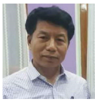
By: N. Munal Meitei

World Food Day is observed on 16 October every year since 1979 with this year's theme 'Leave no one behind.' The primary focus is to tackle global hunger, malnutrition, obesity to hunger and strive to educate people about the right to safe, hygienic and nutritious food as the basic necessities for all humans and to reduce food wastage and unfair allocation of resources to ensure healthy diets for the future generations.